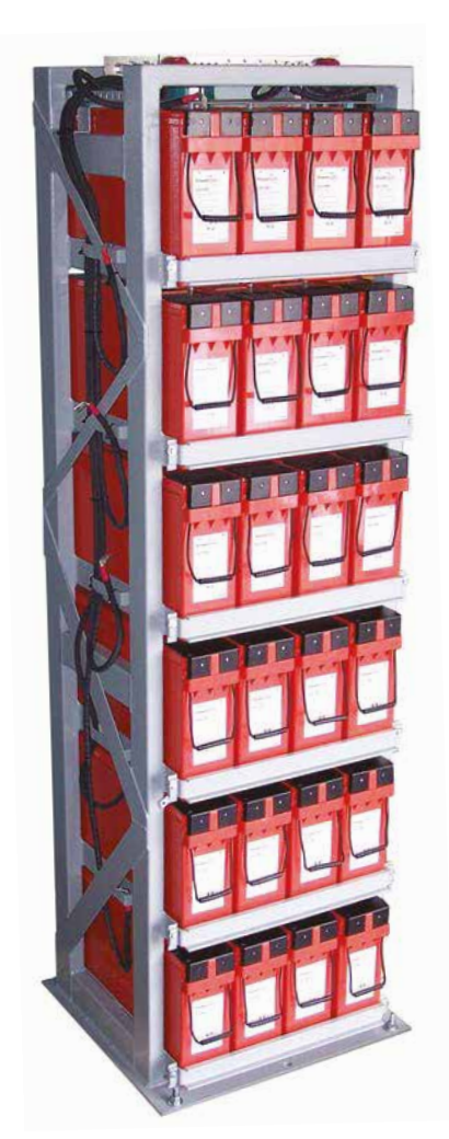
48V 1,140Ah Systems, Six Strings of SBS190F